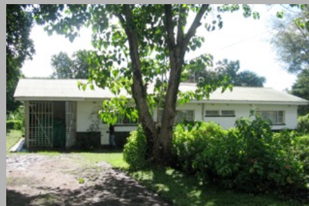
In Namiwawa - our house