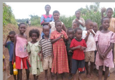
Children from my daily walks