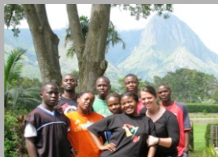
Young Life Leader Retreat