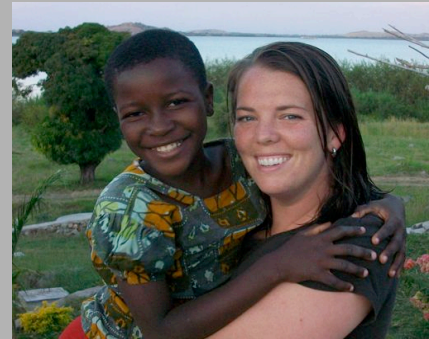
Happiness and me in TZ