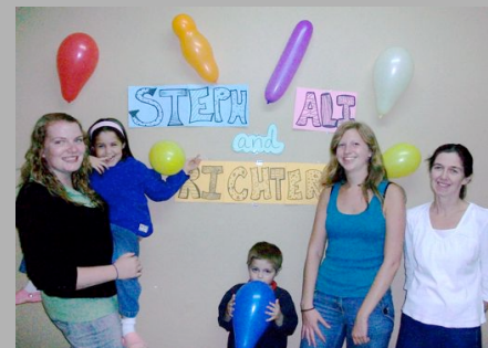
Going away party for friends