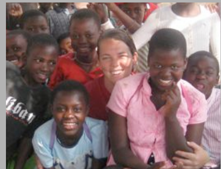
vacation Bible School