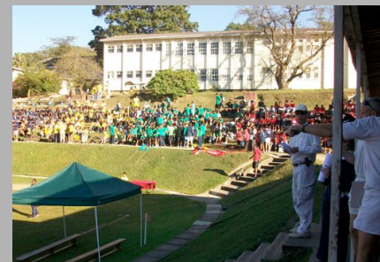
SAINTS sports day