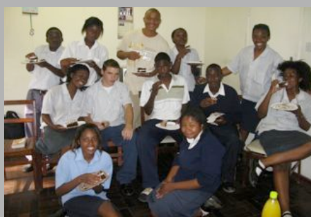
YL Campaigners PARTY!!!