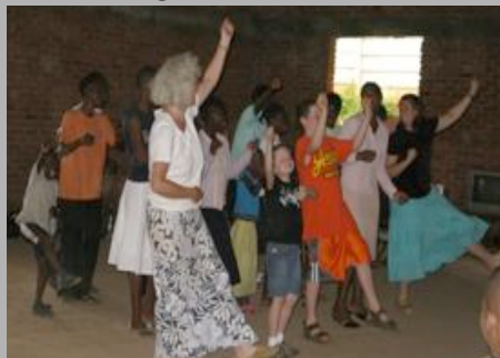
The 'AZUNGU' Dance