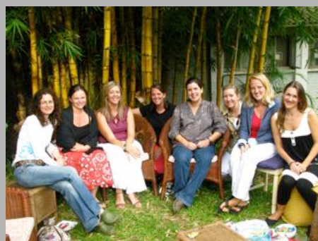
Girls from my small group